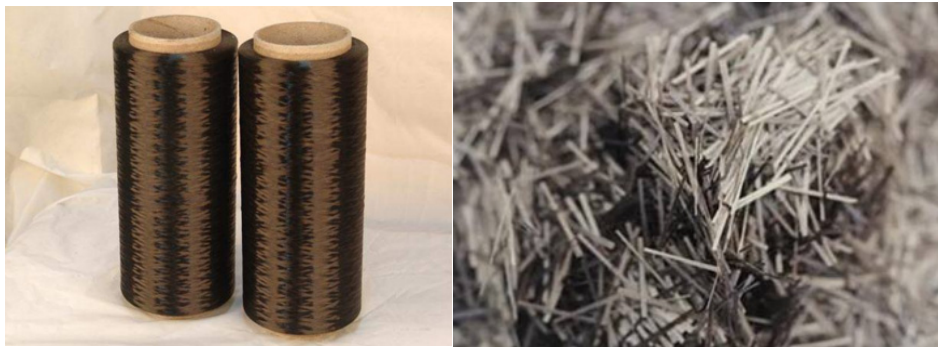
Figure 1. Basalt fiber.

Basalt fiber is a continuous fiber made of melting basalt stone at 1450 to 1500 degrees through Platinum rhodium alloy bushing. It is a new environmental protection fiber which is known as the twenty-first Century ‘volcano rock silk’, it is also called golden fiber because its color is golden brown.